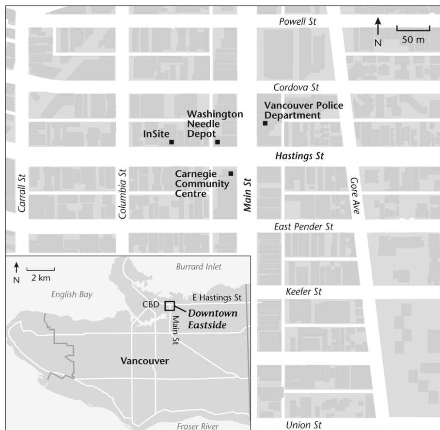
Figure 1 Map of the Downtown Eastside of Vancouver.

The city's proximity to Vancouver's DTES is unique because many IDUs can access InSite by travelling on the train for 45–60 minutes. Finally, Victoria, is a small city located on the southern tip of Vancouver Island. The city's Downtown neighborhood was chosen as a