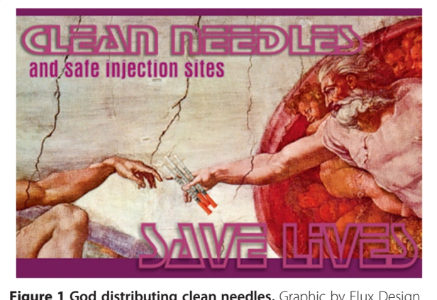
Figure 1 God distributing clean needles. Graphic by Flux Design.

In the year preceding the opening of Insite in 2003, I was collaborating on a draft press release in response to local opposition to harm reduction. The press release simply stated that addiction is, primarily, a healthcare matter. At that time, the notion of publicly stating that addiction is a healthcare rather than criminal justice issue was so controversial that I could not convince anyone in the establishment to lend their name to the press release. In the end, two community activists agreed to sign their names to what was, at the time, a provocative