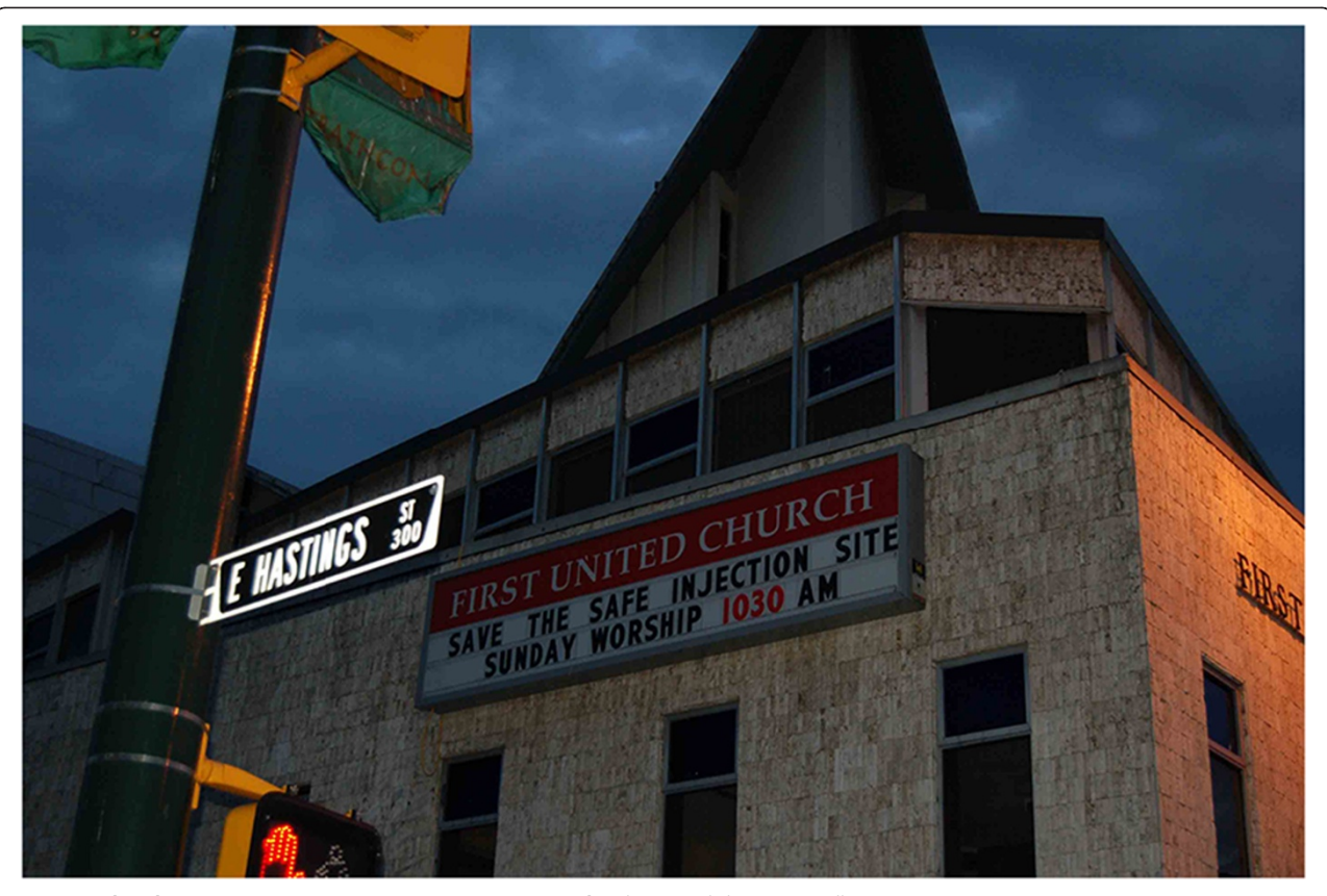
Figure 5 Church Marquee in Vancouver's Downtown Eastside.

win the championship. Supervised injection is healthcare and whether it is required in a jurisdiction needs to be determined by evidence and not arbitrary opinions or fickle political stances in search of votes. If science and medicine have established the best course of action, then we shouldn't turn to opinion polls to determine the best healthcare (Figure 4).