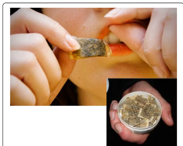
Figure 1 Snus smoke-free tobacco. Snus is an oral tobacco product that comes in a pouch of some sort, designed to be placed between the gums and upper lip. Snus is not chewed and requires no spitting. The standard pouch holds 1 gram of finely ground tobacco. Snus is regulated as a food in Sweden, and thus held to strict quality standards. Swedish snus was developed to greatly reduce TSNA content, and research shows that snus does not increase the risks of cancer of any type.

The issue of abuse liability has been recently used by opponents of THR to warn about potential risks of smokeless tobacco products. Hatsukami et al. [52] concluded that smokeless tobacco appears to have slightly lower abuse liability, with possibly lower severity of addiction or dependence compared with smoking and greater ease of cessation. They also concluded that it may be possible that switching from cigarettes to smokeless tobacco would increase the potential for cessation from all tobacco products. Fagerström and Eissenberg came to similar conclusions in a recent comparison of dependence among smokers, smokeless tobacco users and users of medicinal nicotine [53]. Many former smokers in Sweden have quit through using snus, suggesting it may be a more